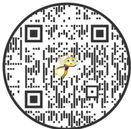
Vacation Bible School